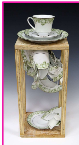
Sculpture by Adelaide Kezsler