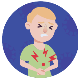
Nausea or Vomiting