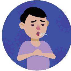
Shortness of Breath or Difficulty Breathing