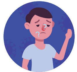
New Loss of Taste or Smell

3. Was your student in close contact— within 6 feet for 15 minutes, with or without mask— of someone with a suspected or confirmed case of COVID-19 (lab or diagnosis) in the last two weeks, or someone getting a test or waiting for test results?