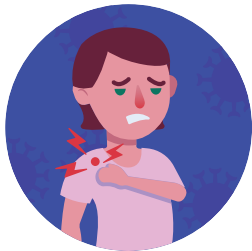
Muscle Pain and Fatigue