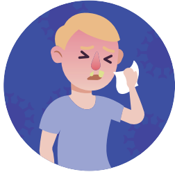
Congestion or Runny Nose

2. Does your student display any other symptoms or signs of illness?