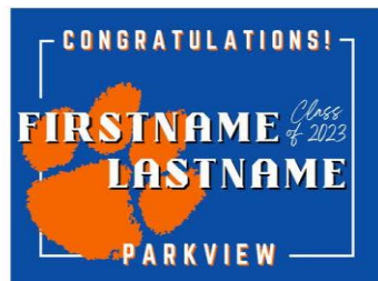
YARD SIGN 24" X 18" $25 SINGLE SIDED