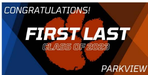
SMALL BANNER 3' X 5' $65 SINGLE SIDED LARGE BANNER 4' X 6.5' $100 SINGLE SIDED NEIGHBORHOOD 4' X 8' $150 SINGLE SIDED