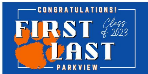
SMALL BANNER 3' X 5' $65 SINGLE SIDED LARGE BANNER 4' X 6.5' $100 SINGLE SIDED