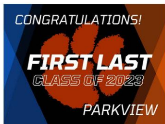
YARD SIGN 24" X 18" $25 SINGLE SIDED