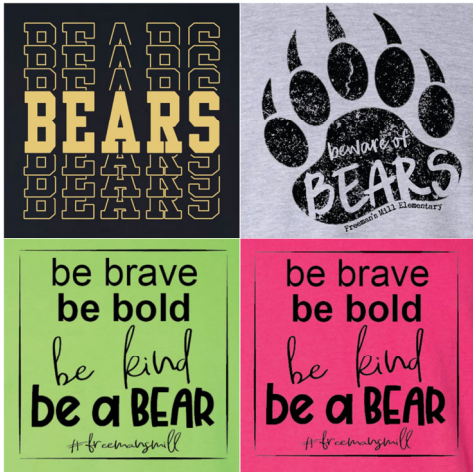
DESIGN 3 LIME