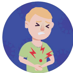
Nausea or Vomiting